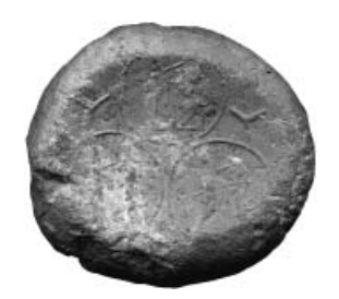
Fig. 25: BM 84551.