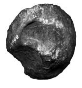
Fig. 28: BM 89947.