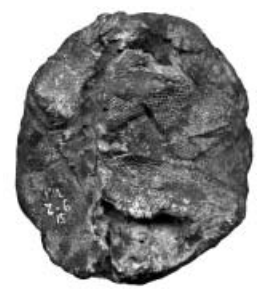
Fig. 17, a-b: BM 84791.