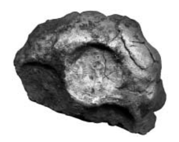
Fig. 16: ND 808.