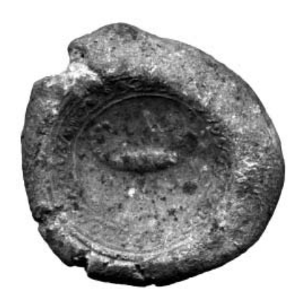
Fig. 7: BM 84550.