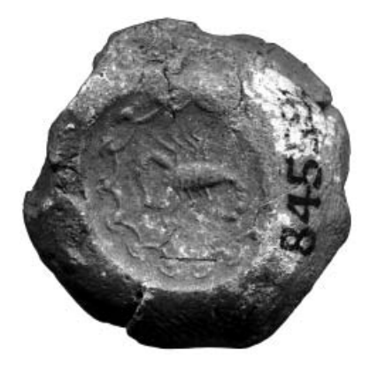
Fig. 6: BM 84559.