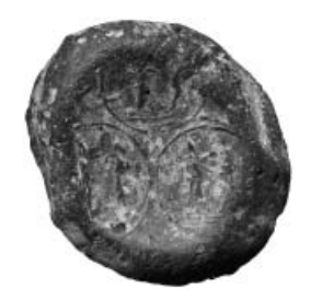
Fig. 27: BM 84687.