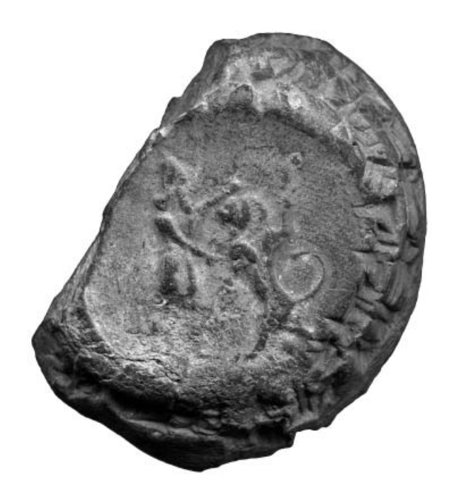
Fig. 4: K 391.