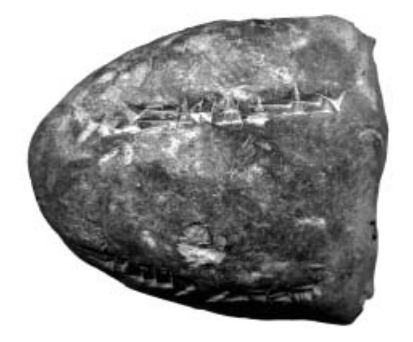
Fig. 20, a-b: 85-2-22, 40.