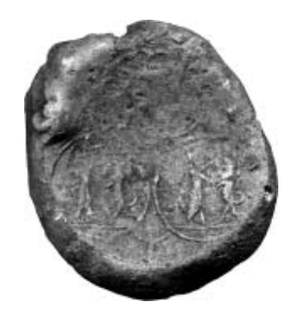
Fig. 24: BM 84579.