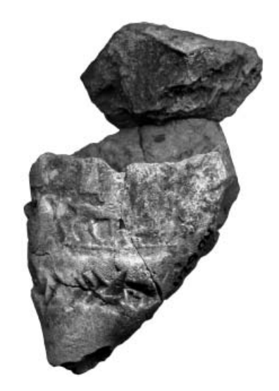
Fig. 2, a-b: ND 6211.