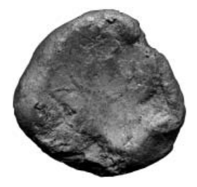
Fig. 26: BM 84579.