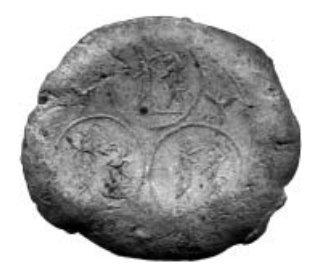
Fig. 23: BM 84551.