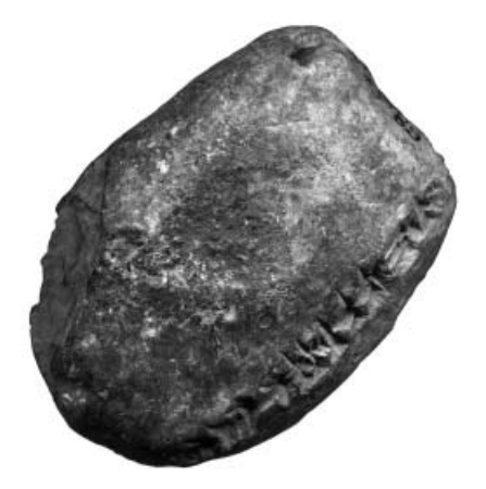
Fig. 13, a-b: K 348.