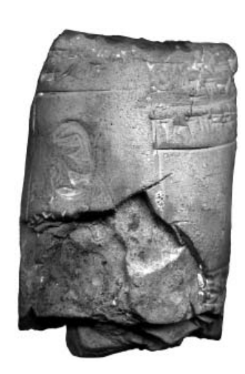
Fig. 1, a-b: K 1995.