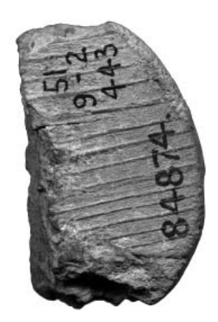
Fig. 5, a-b: BM 84874.