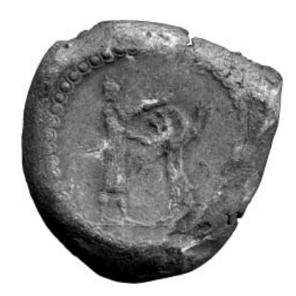
Fig. 3: BM 84672.

The so called 'Assyrian royal seal type', showing the king stabbing a rearing lion with his sword (e.g., BM 84672; fig. 3), is by far the best known and also best attested bureau seal (Sachs 1953; Millard 1967; Millard 1978; Herbordt 1992: 123-136; Maul 1995). Suzanne Herbordt (1992: 124-127 11) was able to collect a minimum of 104 individual seals which were in use over a span of roughly two centuries, the earliest dated by the cuneiform label inscribed on the clay sealing to the reign of Shalmaneser III (858-824 BCE) 12. The motif could also be used for a king's personal cylinder seal, as illustrated by the seal of Esarhaddon (680-669 BCE) which can be identified by its inscription and is known from a sealing from the Review Palace of Nimrud (CTN 3 26; Watanabe 1993: 110-111: no. 2.2).