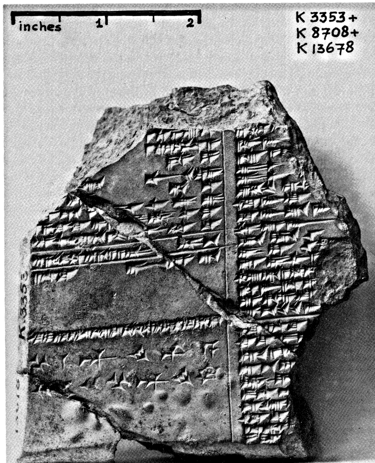
3. K 3353+, with Ashurbanipal colophon added subsequently.

baked or not. Some of them were indeed so effectively baked during the conflagration of 612 BC that the job might as well have been done professionally, but there are others in which one can see a whole range of colours and densities, from a relatively soft red to the hard green of vitrification. On the whole it seems likely that the "library" texts, unlike many of the Middle Assyrian ones and of course all the foundation documents, were not baked originally. The same applies to the royal letters, many state documents, and the private archives; these generally are made of any one of a wide range of inferior clays, only baked if at all in 612.